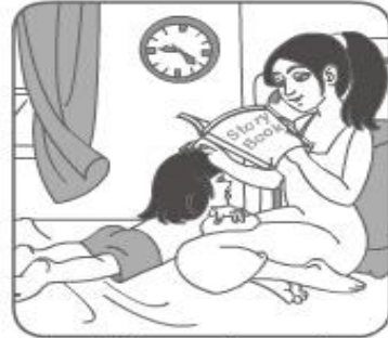
She listens to a story after dinner.