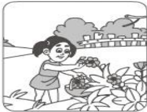
She was collecting flowers.