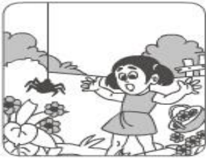
Mary was scared.

Look at the pictures below and number them in the correct order to make a story.