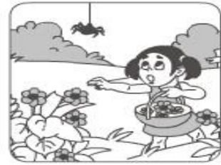
Suddenly she saw a spider.