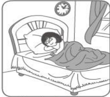
She is sleeping.

Look at the pictures below and number them in the correct order to make a story.